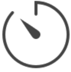
24 Hours Usage